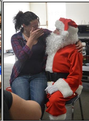
Santa offers comfort