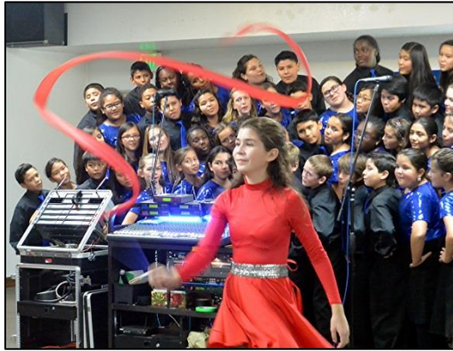
Bellflower Ensemble performs