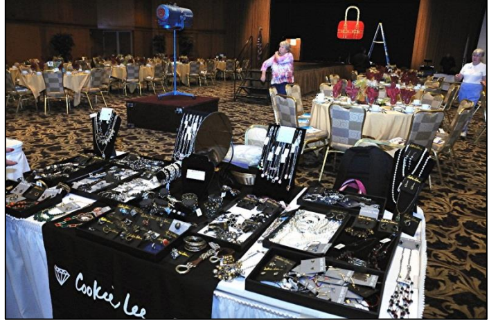
The Room – before guests arrive