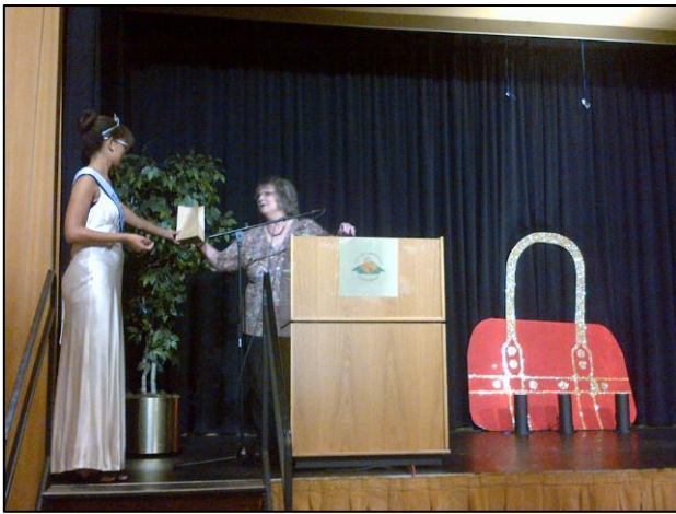
Marcie handled the raffle drawings with help from the Bellflower Princesses