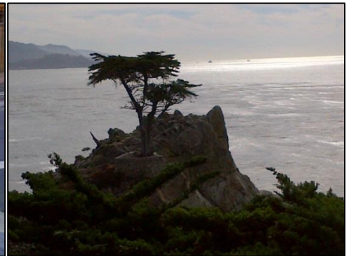
The Lone Cypress on 17 mile drive

Soroptimists who went on the road trip had a great time! They saw 17 mile Drive; lunched in Carmel; of course Ghirardelli Square was visited as well as Fisherman's Wharf and China Town. Cables cars were ridden and tours of the City were taken on a double-decker bus. Some wonderful restaurants were discovered and delicious food eaten. Above all, everyone had fun, friendships were deepened and the consensus was – we need to do more trips like this in the future. Planning will be done!!!