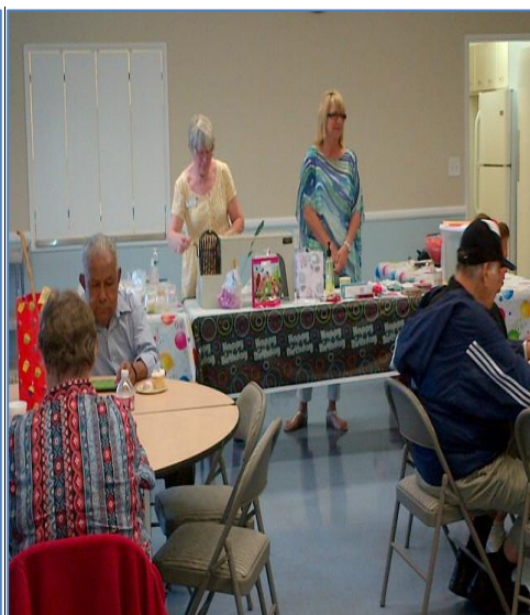
Soroptimist Members were Bingo callers at the Village Birthday Bash