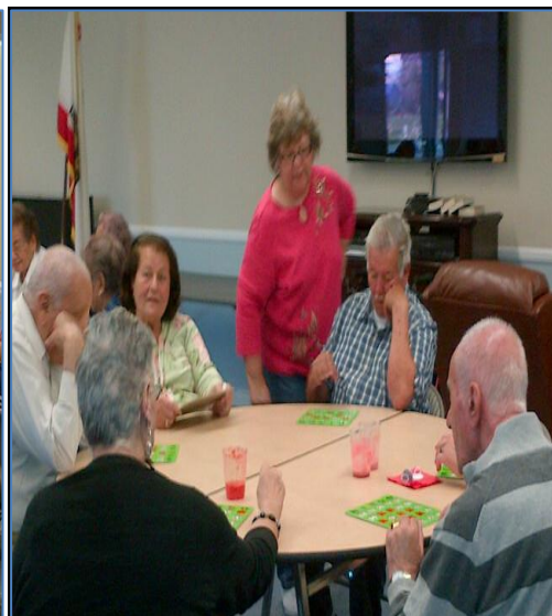
Soroptimist member helps the Villagers find their numbers