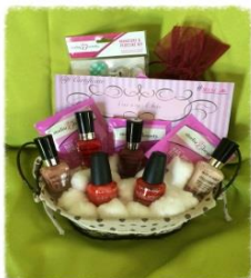
A day at the Nail Salon