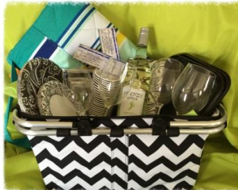
Picnic at the Hollywood Bowl