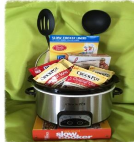
Cuddle Up with Soup