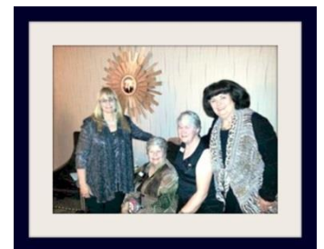
Bellflower's Soroptimists were in attendance at the Soroptimist Recognition Banquet on June 13 th .

Soroptimist is committed to investing in programs that have a sustainable, measurable change for women and girls. Clubs also participate in local level projects such as providing mammograms to low-income women; working to end sex trafficking for women and girls and mentoring women in domestic violence shelters.