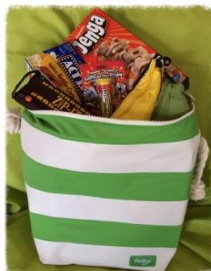
Family Board Night