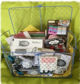
Scrapbooking’ with Stampin’ Up

We have a wonderful assortment of vendors who will be auctioning off some of their products, as well as selling at their tables. Be sure to stop by their tables before the auction and say Hi! Here is a sample of Opportunity Baskets vying for your Raffle Ticket . Buy your Raffle Tickets for a chance to walk away with some wonderful baskets.