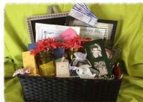
An evening with the Philharmonic at the Hollywood Bowl

SIB QUARTERANIA IS THE PLACE TO BE ON AUGUST 15TH!!