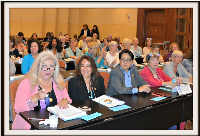
Business Meeting at the 2015 Spring Conference

One of our very own members summed up her feelings after attending Spring Conference for the first time by saying this: