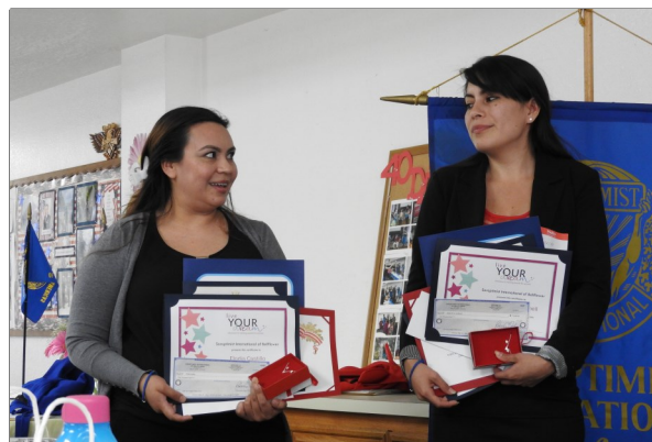
Live Your Dream Award Winners

Congratulations to all of these wonderful women! May your success in life be because you chose to stand tall in diversity and earnestly wanted to do something to better what was your life, to what your life will be in the future . You are truly an inspiration to us all!