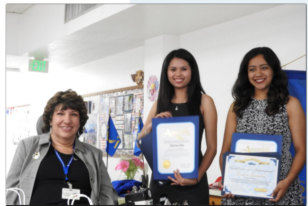
Soroptimist International of Bellflower Scholarship Award Winners

Strong in their determination to succeed in life one step at a time!