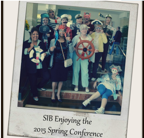
SIB Enjoying the 2015 Spring Conference