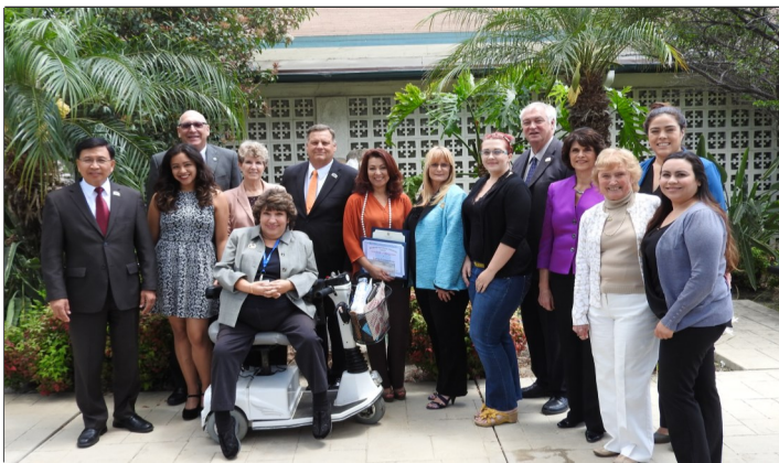
Dignitaries from Congress, State and the City of Bellflower were on hand to celebrate the desires and accomplishments of our Awards winners.